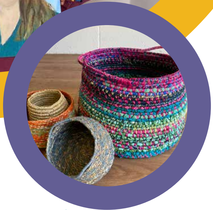
Anne Thoday's Baskets

Other challenges into the next twelve months include: