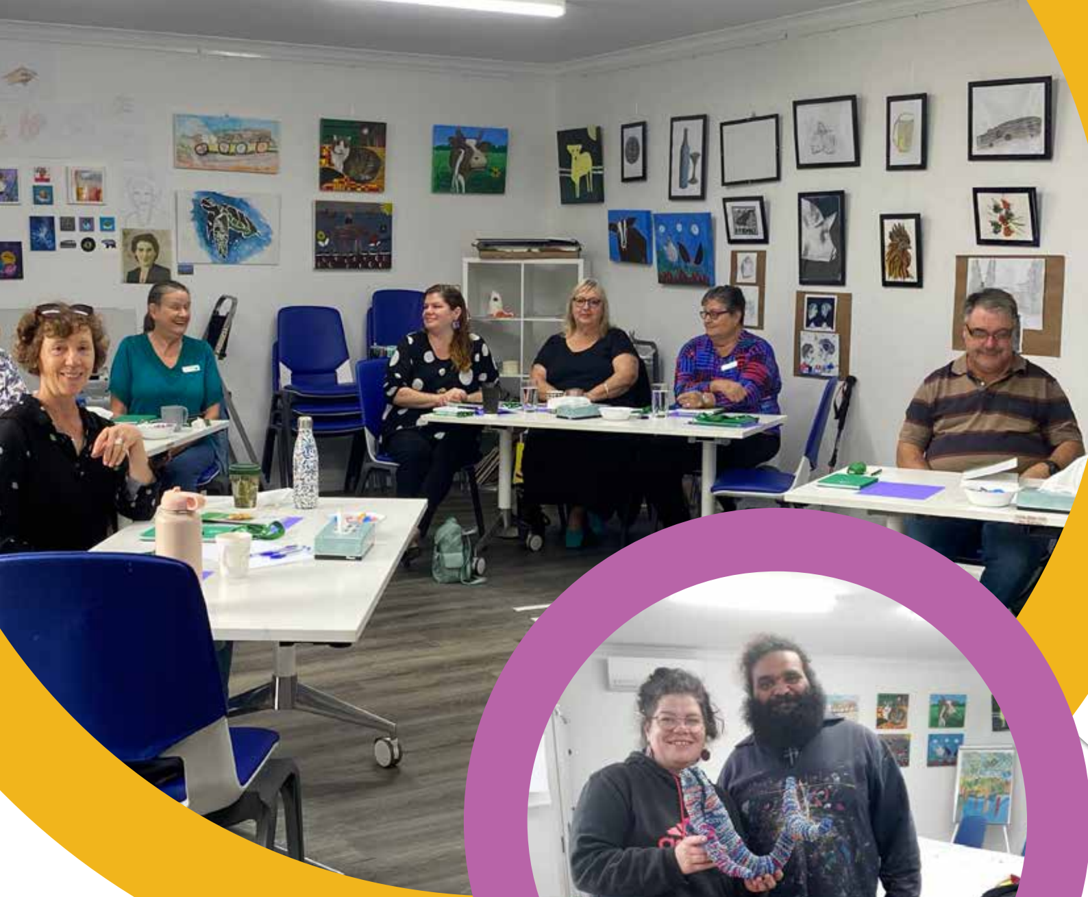
Volunteer Mental Health Training