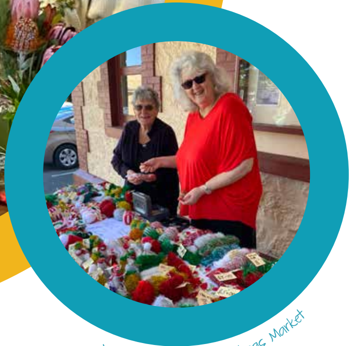
Yarncraft stall at Christmas Market