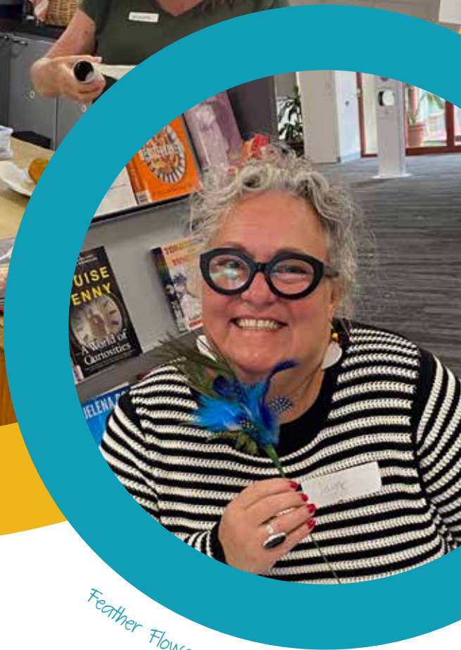
Feather Flower Making Workshop