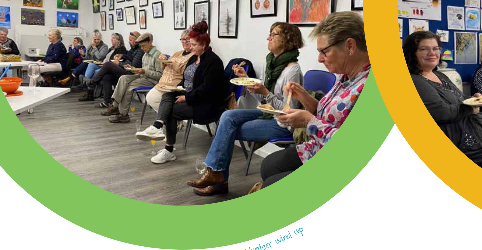
End of Term Volunteer wind up