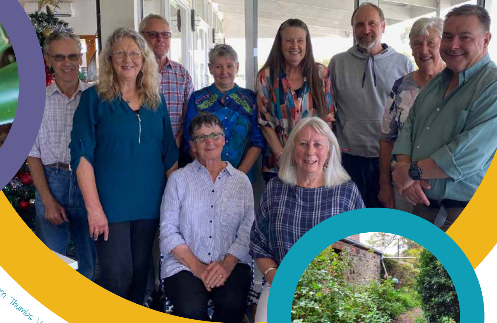
Green Thumbs Volunteers