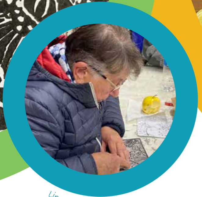
Lino Prints Workshop