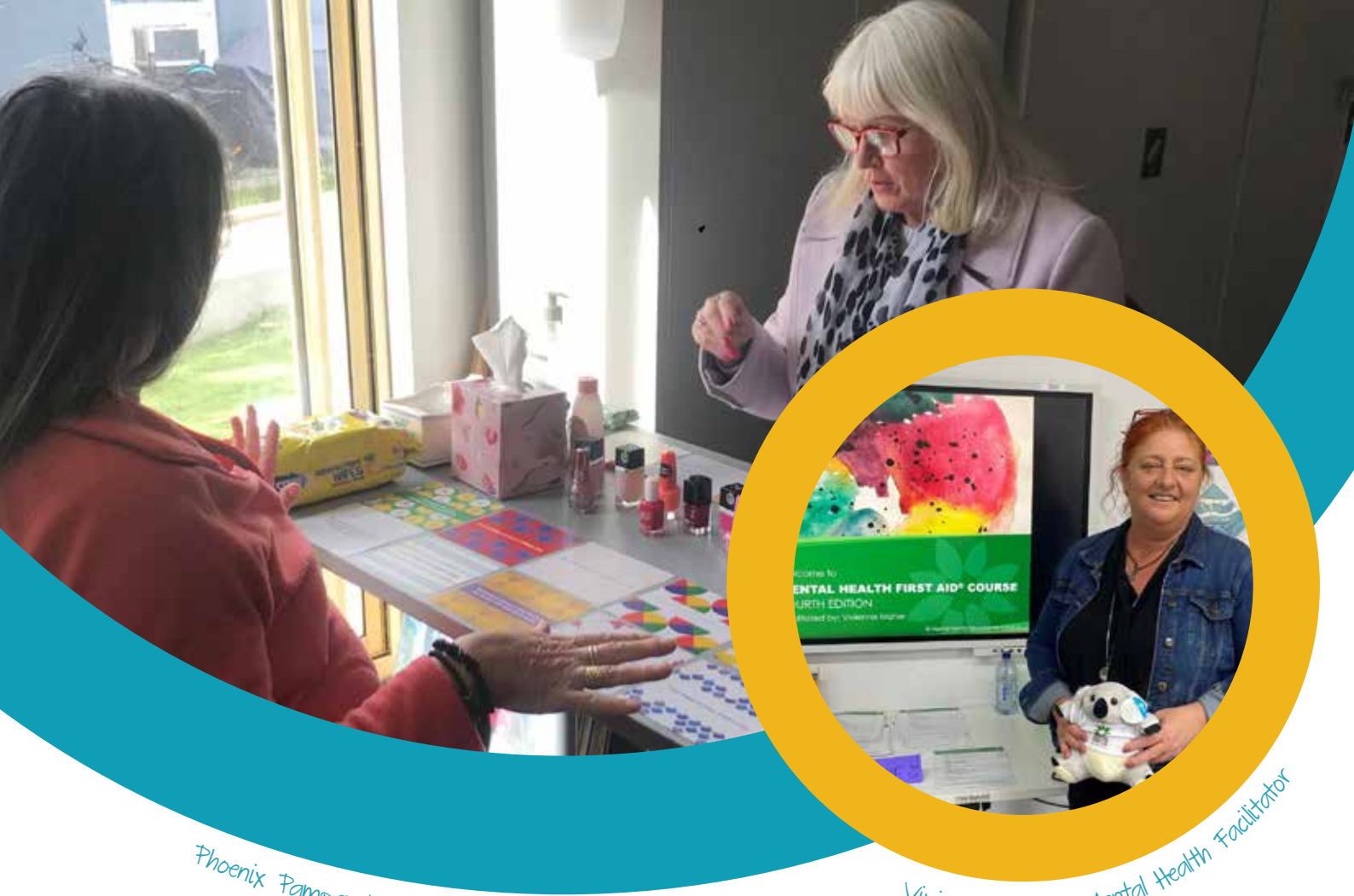
Phoenix Pamper Day