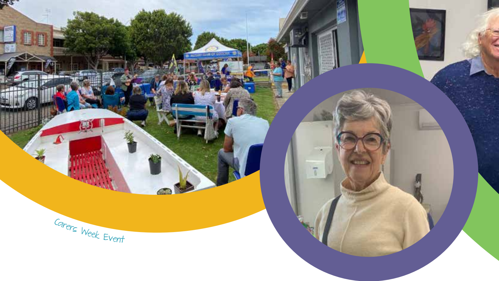
Carers Week Event