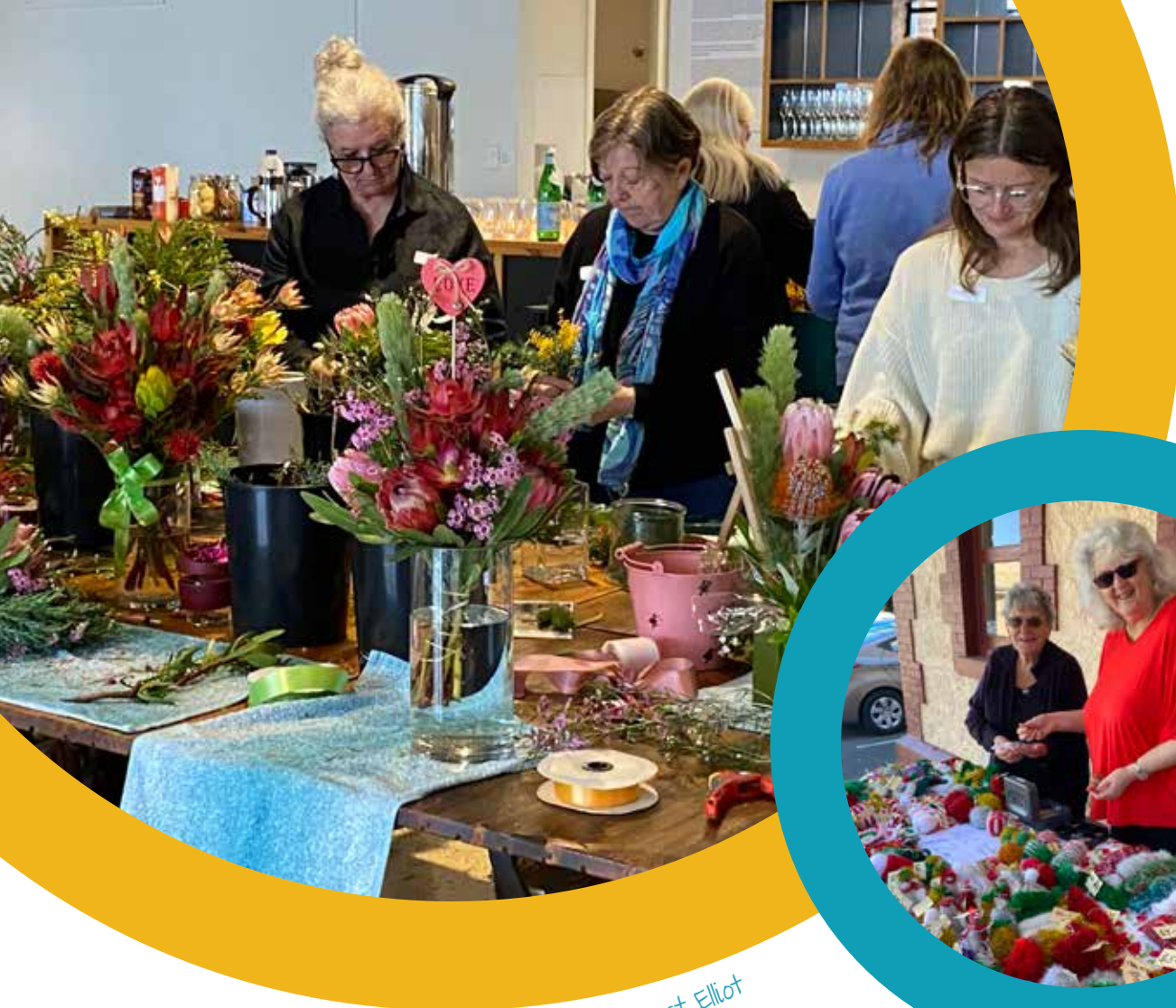
Floral Bouquet Workshop in Port Elliot