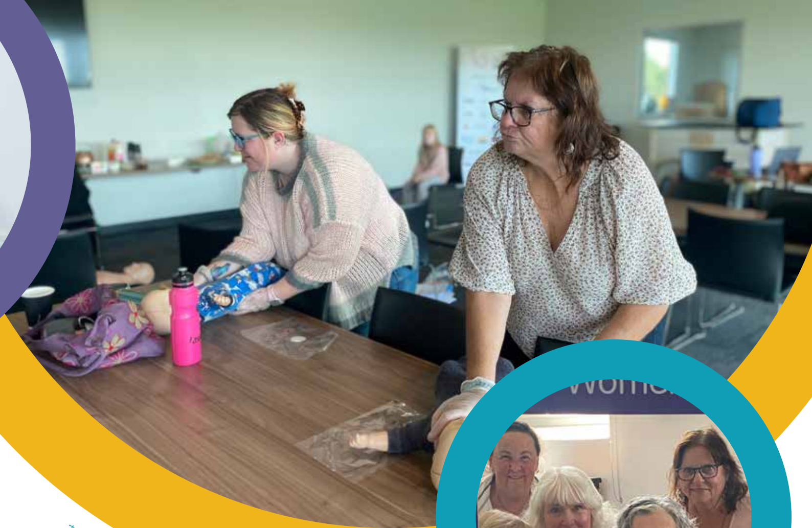
Phoenix First Aid Training