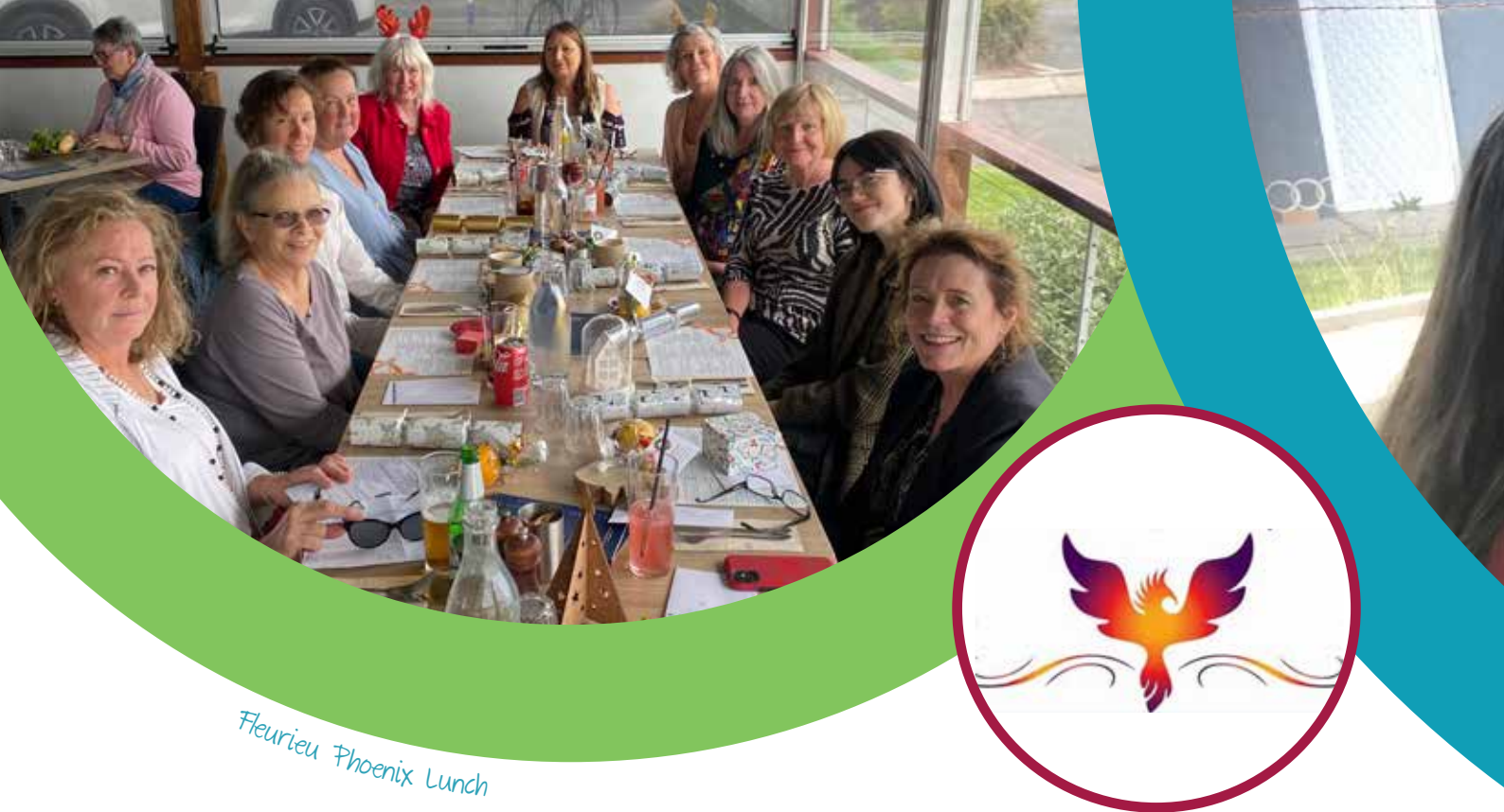
Fleurieu Phoenix Lunch